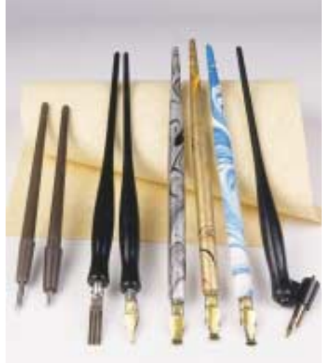
Speedball<sup>®</sup> Hunt<sup>®</sup> Dip, Pen Holders, Pens & Steel Brushes Interword space: The space between words.

Interlinear space: The space between lines of writing.