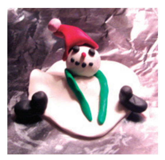
This is the general idea of the "melting snowman" and can be made in any size depending on your jar.

1-2 Packs of white Sculpey clay1 Pack of Sculpey in: black, orange,1-2 other colorsRolling pinAluminum foilWax or parchment paperOven proof dish/cookie sheet