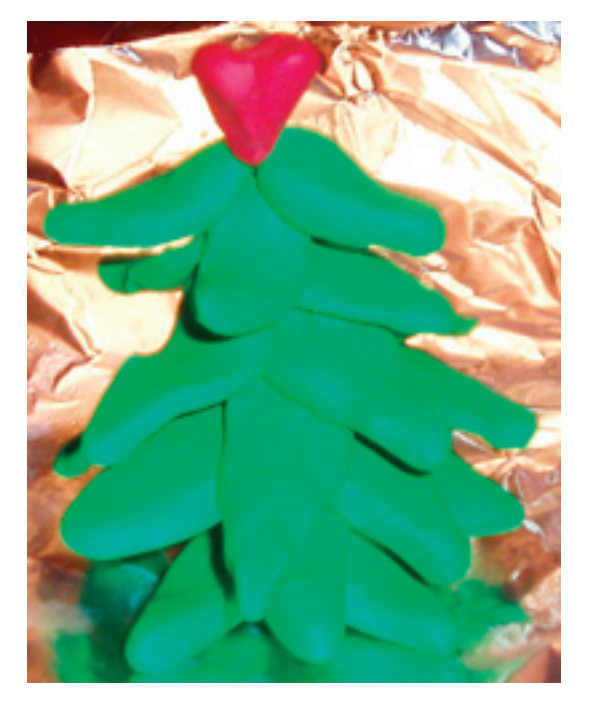
Example of a tree not yet on a base. Remember to keep in mind the size of your jar when building your tree.